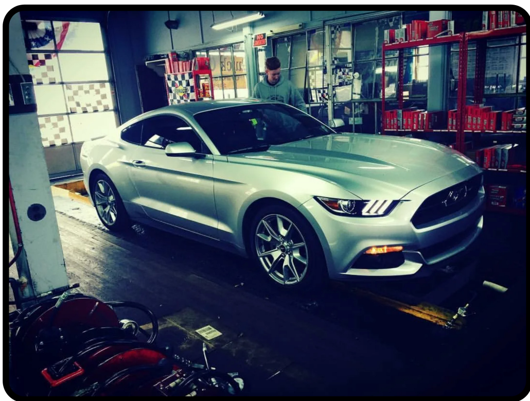
2020 Ford Mustang GT Submitted By Harrisburg PA Store